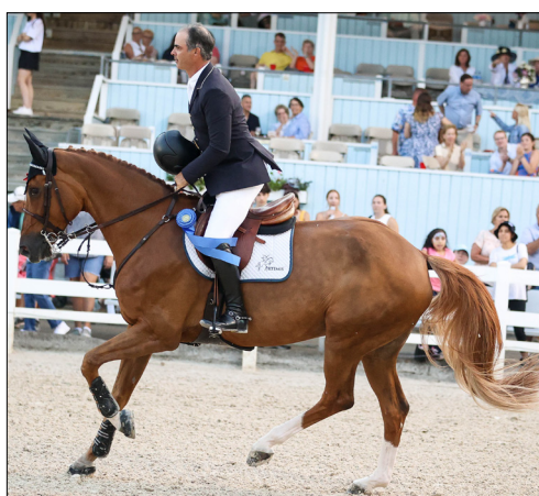
Rodrigo Pessoa & Venice Beach Speed Stake Champion

"The courses were great. I thought it was a really perfect course and got the right amount of clear rounds. The time was good. It was my first time here so it was amazing to compete. I've never been and the atmosphere is already great on day one."