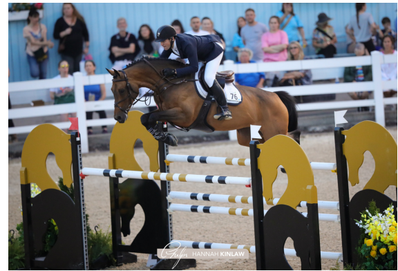
McLain Ward and First Lady

The night cap of Wednesday's jumper competition was another FEI CSI4* class, the $38,700 Main Line Challenge. Forty-seven horse and rider combinations, representing five different countries, prepared to enter the Dixon Oval and test the limits on the Anderson Lima designed course. As the biggest class of the 2023 Devon Horse Show to date, the fans filled the grandstands to witness a world class show jumping event.