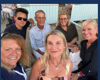
FOR MORE INFORMATION ON THE DEVON HORSE SHOW, PLEASE VISIT: www.devonhorseshow.net