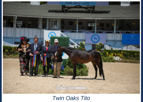
Best Young Pony

The final day of the 2023 Devon Horse Show saw several awards handed out in the Dixon Oval for the Hunter Pony Breeding and the Pennsylvania Breeding divisions. For ponies, the qualities that are considered in the judging are height, quality, success of sire and dam, and what the plan is moving forward with the foal.