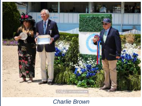
Leading Pony Breeder Handler Award