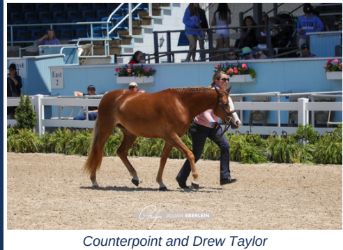
Hunter Pony Filly/Mare Champion