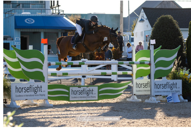
Kama Godek Lady Stakkata