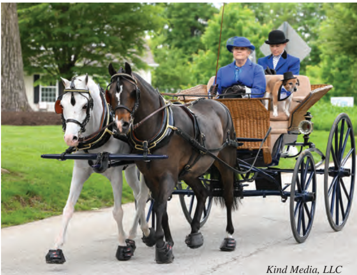
Kind Media, LLC

To be eligible, horses must have been entered, shown and judged in class 398.